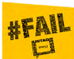
Protect your digital image