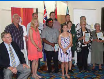
Award recipients at Bundaberg Civic Centre