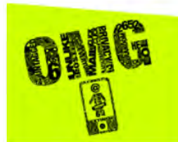
Sexting affects you socially and legally