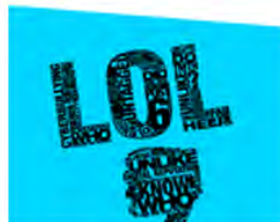
Protect yourself from cyberbullying