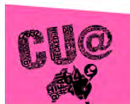
Geolocation - checking in?