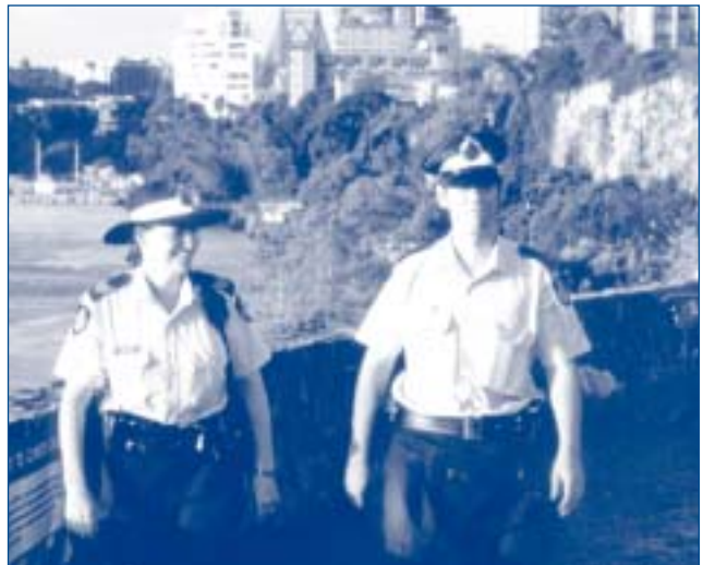
A police presence helps to assure the community of a safe and secure environment.

Generally, good performance is associated with a decrease, or minimal increase, in the number of reported offences. However, this rule does not apply to the Other Offences category where the Service often associates good performance with an increase in the number of reported offences. This is because offences included in this category, such as unlawful possession of drugs, are detected and reported by police. Therefore, an increase in the number of reported drug offences indicates that police are actively identifying and charging offenders.