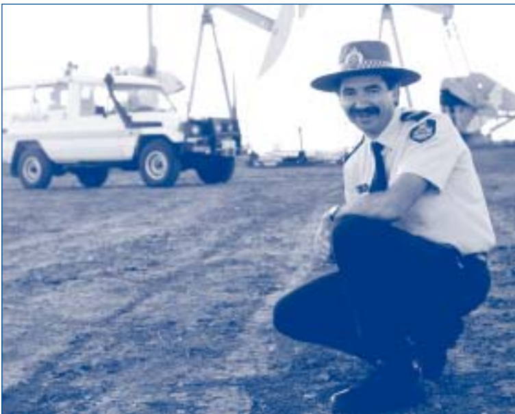
Police officers provide a service to outback regional communities.

The small increase in total Offences Against the Person largely reflects an increase in Assaults (3%), as the Person Offence total is dominated by assaults. However, increases in Homicide (Murder) (5%), Other Homicide (13%), Sexual Offences (7%), and Other Offences Against the Person (6%) also contributed to the overall increase. In the category of Other Homicide, the most significant increases were in Manslaughter (excluding by driving) and Driving