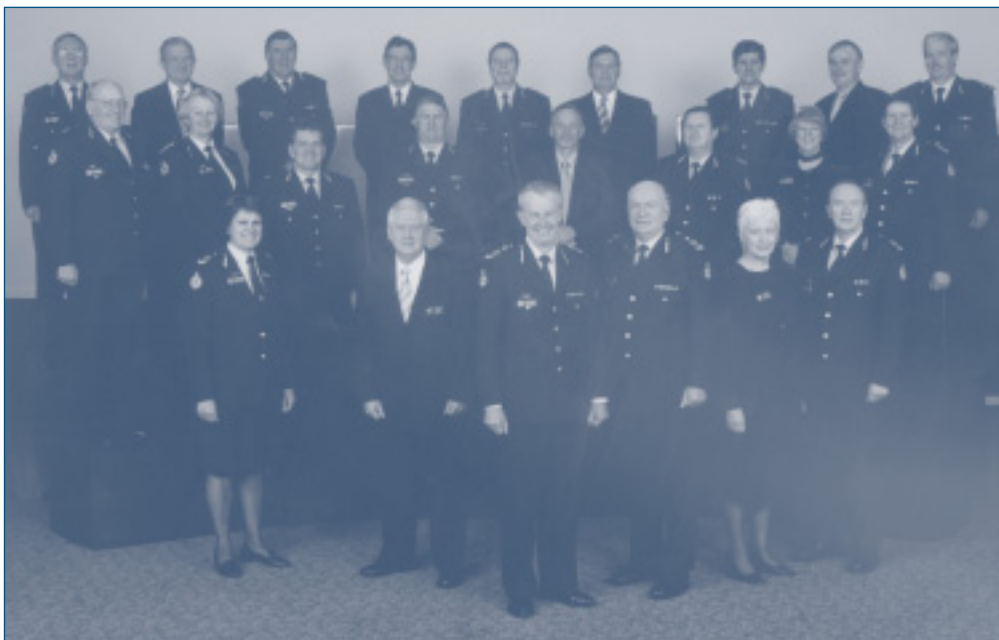
The Service's primary decision making body—the Senior Executive Conference.

The Senior Executive Conference is chaired by the Commissioner. Membership includes all senior executive officers of the Service, two representatives of the Service's Women's Advisory Group and a senior police chaplain. The Conference meets quarterly.