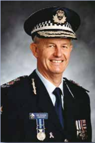
FROM COMMISSIONER ATKINSON