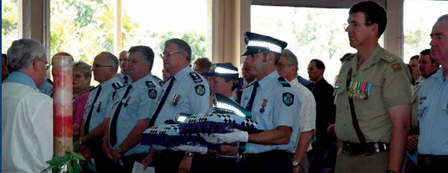
The National Police Remembrance Day service in Townsville.

pay tribute to the courage and resilience of the district's pioneering officers.