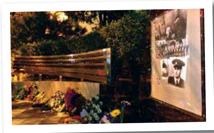
The candlelight vigil in Brisbane.

In Charleville, police and community members gathered to