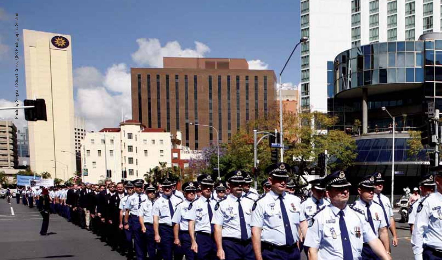
Police march through Brisbane before this year's National Police Remembrance Day service.