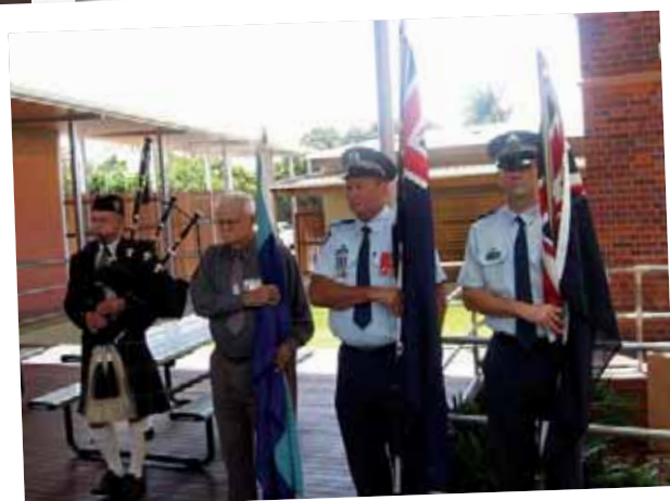
LEFT: Police hats on the altar in Charleville. ABOVE: The Bundaberg service.