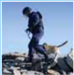
A Police Dog and handler perform searches as part of Exercise Orchid Alert.

management arrangements during an incident that was clearly orchestrated through an act of terrorism.