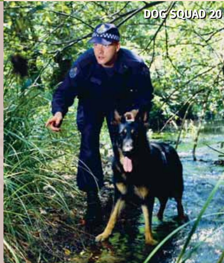
DOG SQUAD 20