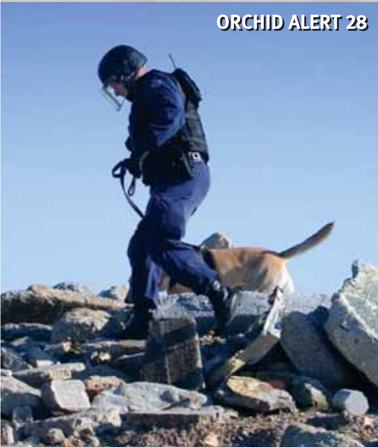
ORCHID ALERT 28

Copyright of this publication is vested in the Commissioner of Police. Reproduction for use other than within the Queensland Police Service is prohibited and requires the written permission of the Commissioner of Police (or his delegate) prior to re-publication or attribution.