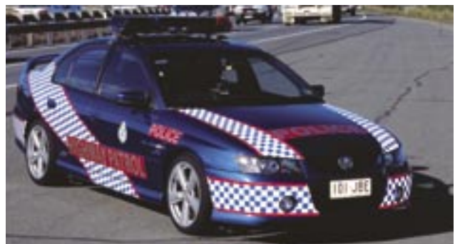
The new highway patrol cars are the latest weapon in the Queensland Government's bid to reduce the road toll