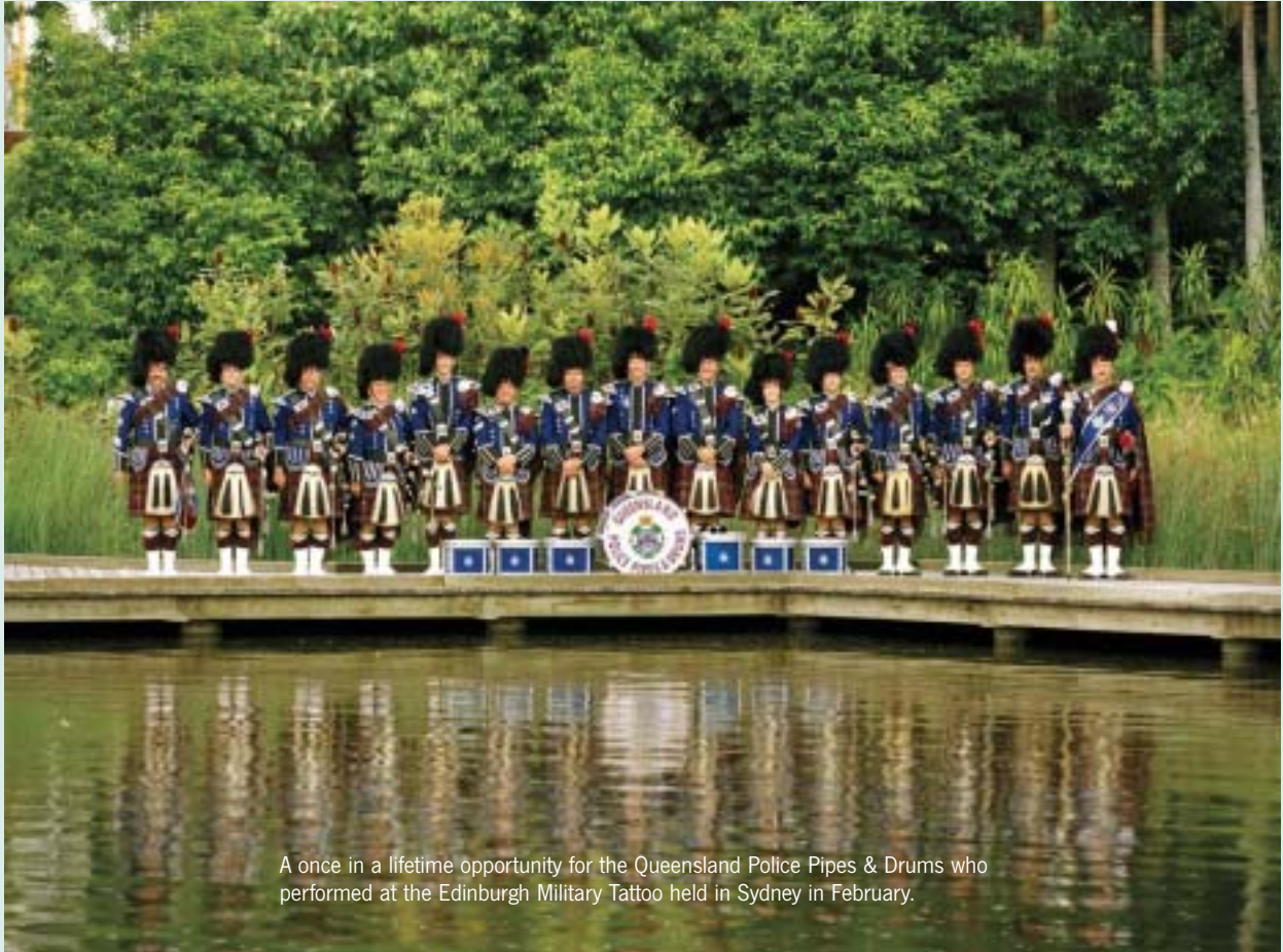
A once in a lifetime opportunity for the Queensland Police Pipes & Drums who performed at the Edinburgh Military Tattoo held in Sydney in February.