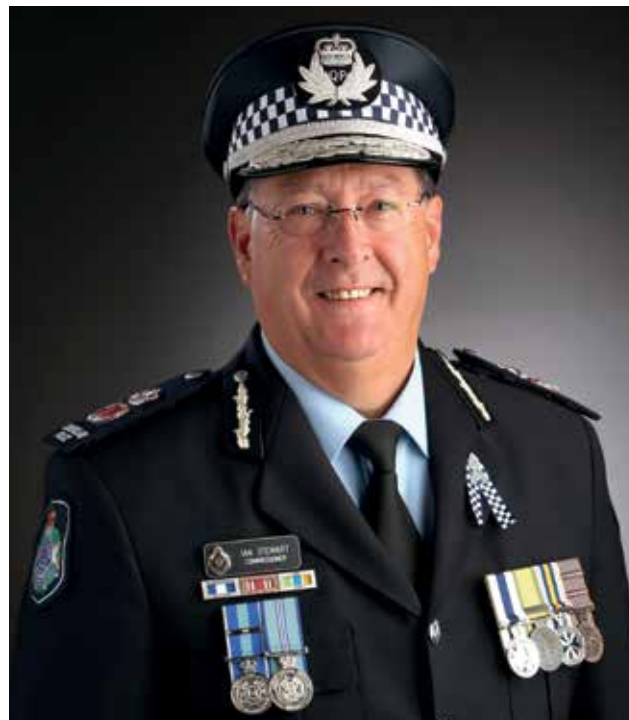
Ian Stewart APM, Commissioner of Police

Targeted campaigns such as the Not Now, Not Ever domestic and family violence campaign, promote awareness and encourage people to report incidents. In 2016-17, following on from the introduction of a specific offence of non