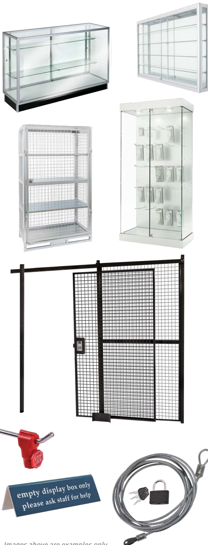
Images above are examples only

Secure storage is mandatory for items classified as Controlled-Secured and Restricted items. It is voluntary for Controlled single-edge knives.