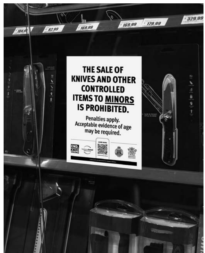
Example of display